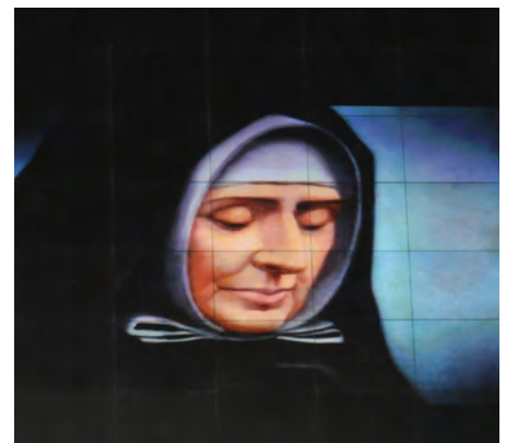
Our foundress Saint Jeanne Jugan