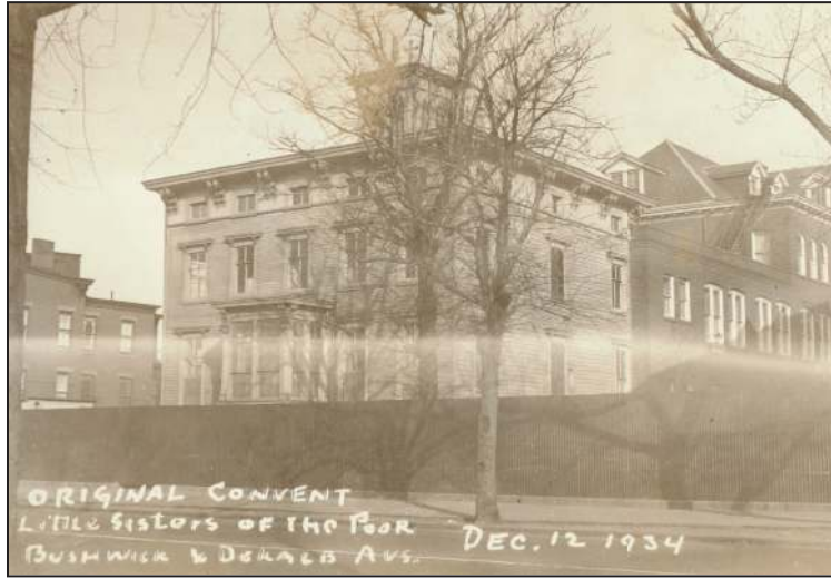
The original convent of the Little Sisters of the Poor in Brooklyn as shown in 1934.