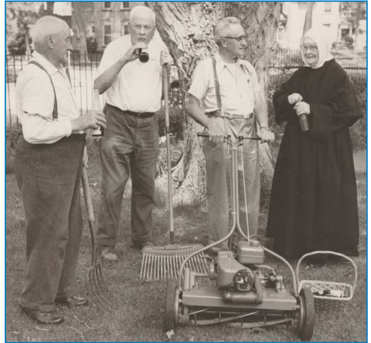
1950s – Residents enjoy a cold drink before trying out the new Jacobson 21 – Queen Lawn Mower!