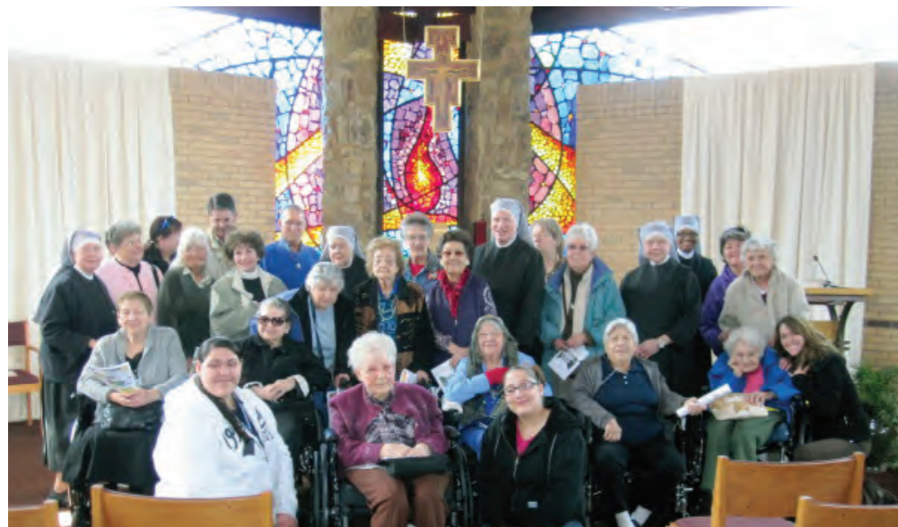
The pilgrims – staff, Sisters, Residents, and volunteers – enjoy the warmth and hospitality of the Spirit of Christ in Arvada.