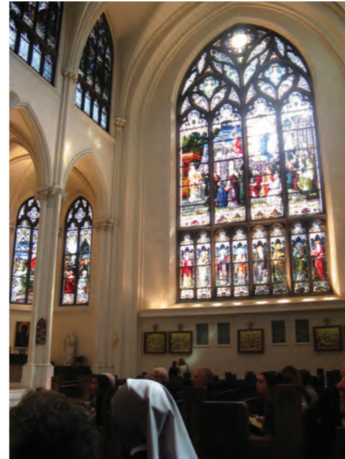
Cathedral Basilica of the Immaculate Conception, Denver.