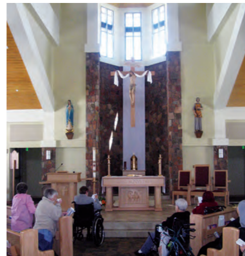
Our Lady of Peace in Silverthorne.