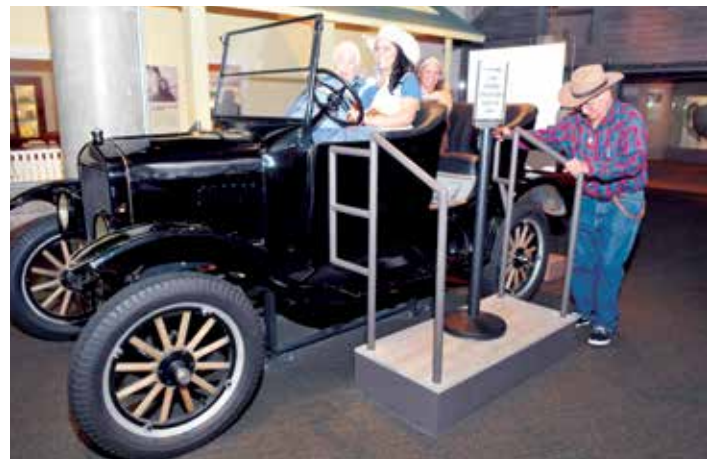
Some of the Residents and staff members attended the event. Here, they enjoy one of the museum’s exhibits – a ride through the Rockies, via a large-screened TV, in a Model T.