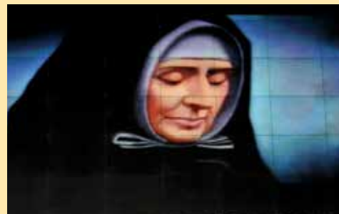
Our foundress Saint Jeanne Jugan

The Little Sisters of the Poor recognizes the importance of protecting information we may collect from visitors to our website. Our policy is to use the information we acquire from visitors to our websites for internal purposes only, and we maintain appropriate security measures to keep this information private.