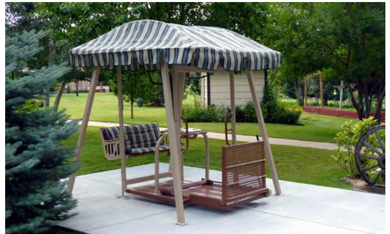
Full view of glider as it awaits another group. It's a wonderful way for Residents, staff, friends, children, volunteers, and family to have a fun experience "together."