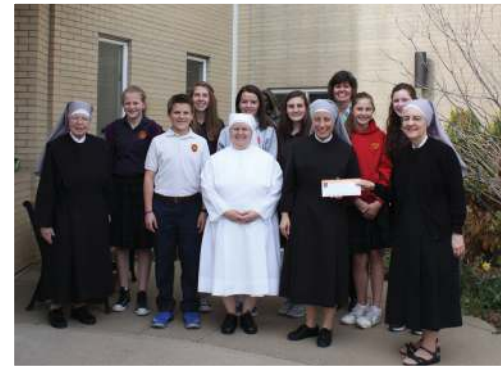
Sisters accept a generous check from students at St. Thomas More. The money covered the cost of new dining room chairs.