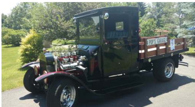
A favorite entry is the old truck from “Pop’s Garage.”

staff and car enthusiasts of all ages were dazzled by the shiny chrome and the deep-waxed bumper-to-bumper presentations of the cars provided by a local car club. Also dazzling was the 90-degree heat but the Good Lord provided us with a light breeze to cool everything down as the Residents reminisced and voted for their favorite classic car.